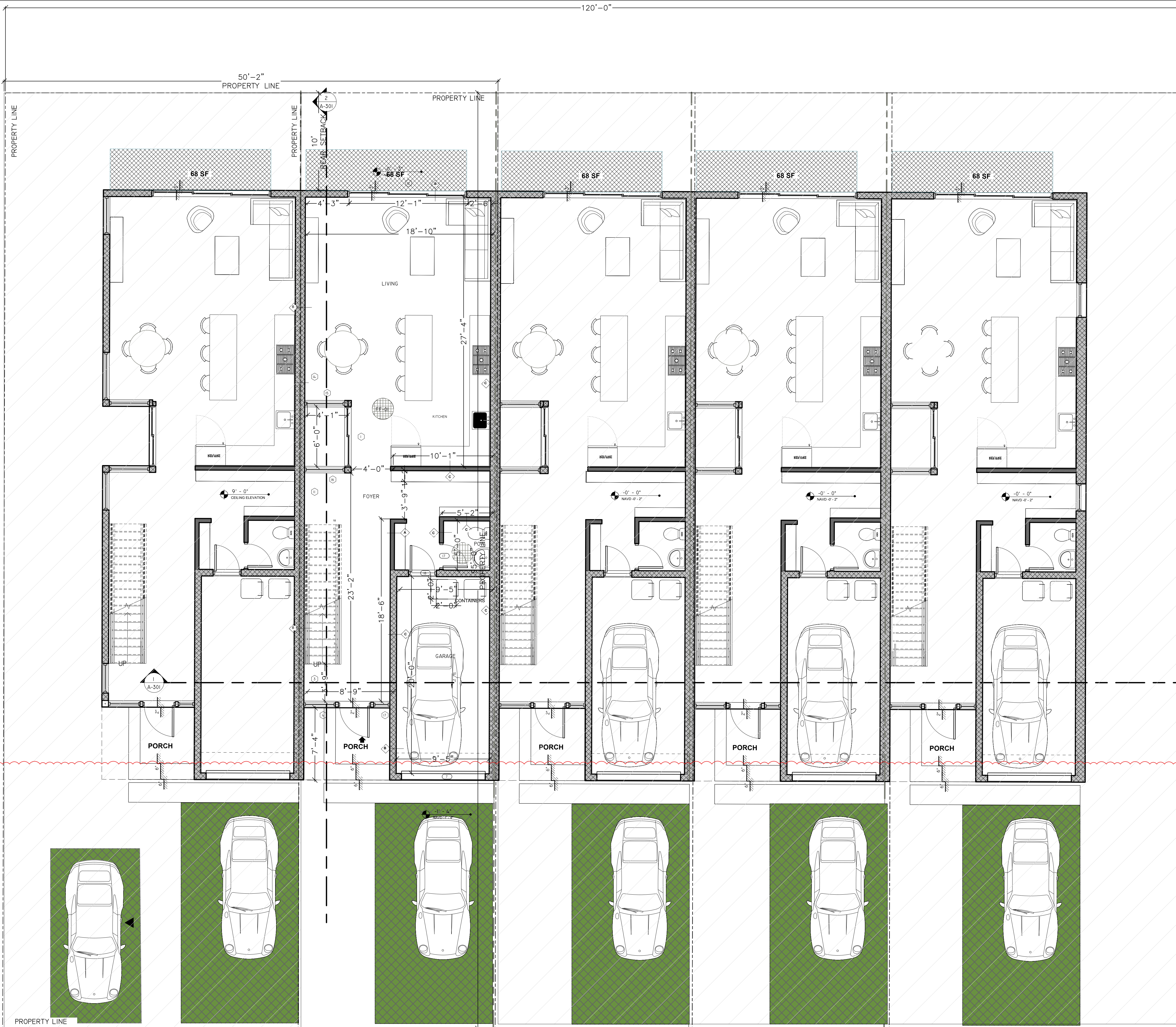
1 FIRST FLOOR PLAN 1/4" = 1'-0"